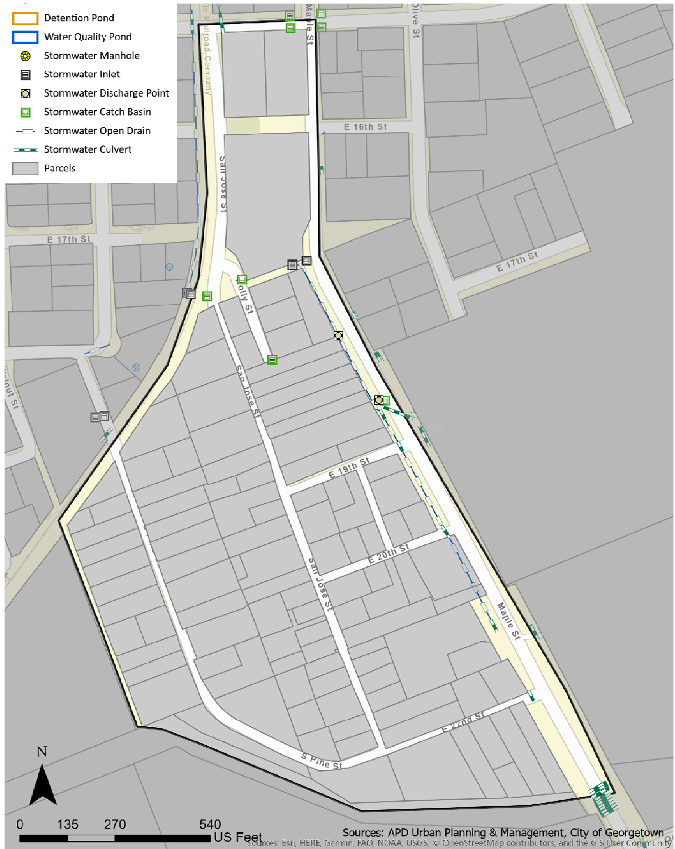
Figure 26: Existing Stormwater Infrastructure in San José