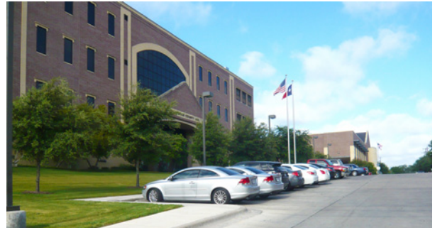
The new jail and justice center acts as a civic activity and employment center.

The Justice Center acts as a civic activity and employment center. It is important to locate commercial uses that serve Justice Center employees to help enliven this area with daytime activity.