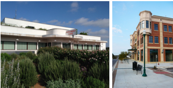
The Monument Cafe and Tamiro Plaza have added a new level of energy north of the square. New development north of the 5th & Austin intersection will help further activate this area.

Indicated as one of the major activity centers in the Framework Strategy, this intersection at 5th and Austin already includes increased activity due to Monument Café and Tamiro Plaza. New mixed-use development on the northern corners of the intersection should further activate this area.