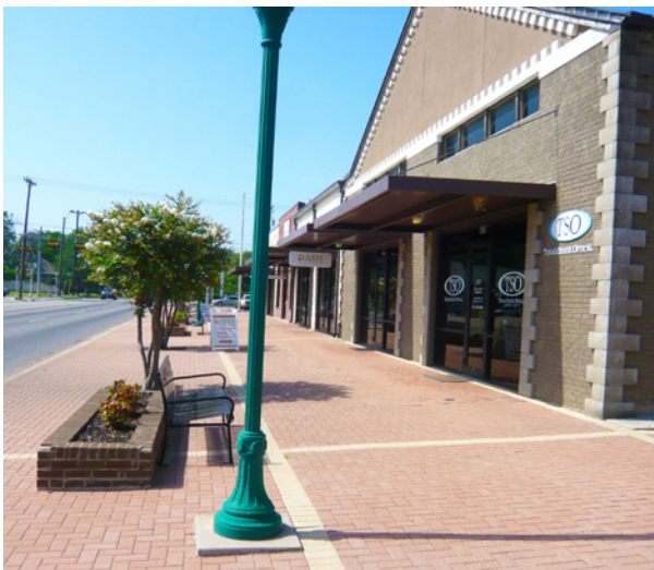
The new retail center at the northwest corner of the intersection is a good example of how new development should orient to the street.

This area is well suited for commercial development because of the high traffic this intersection experiences. Primarily, the street edge should be defined by a storefront wall along Austin and University. A small entry plaza/park or expanded pedestrian zone would be included at the corner(s). This site should also include an important visual link to help guide visitors towards the downtown. The building use is not as important as the provision for landscaping and directional signage. The new retail center at the northwest corner of the intersection is a good example of development orienting to the street.