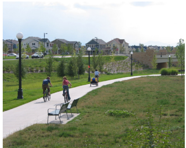
Enhance pedestrian connections to the river trails.