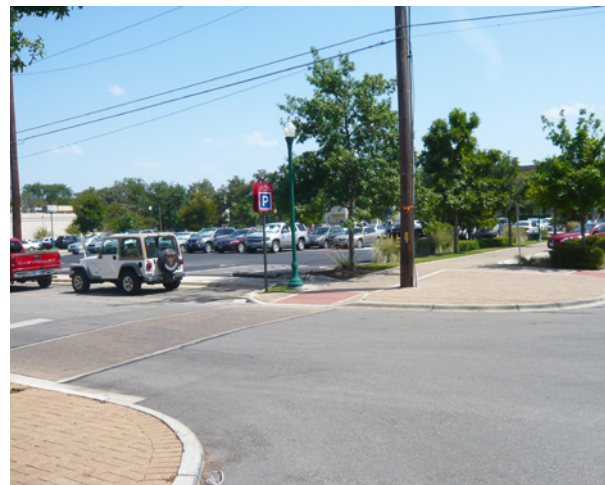
The existing parking lot at 9th and Main Streets should redevelop into a public parking structure with a “wrap” of retail uses fronting Main Street.

This area is designated as the major eastern development anchor in the Framework Strategy. The churches that are clustered in this area form an anchor for the eastern edge of the downtown and the new Union on 8th Event Center will help enliven this area with small local events. The Grace Heritage Center, redevelopment of City Hall (once offices relocate) and new restaurants also add to the vibrancy of this area. These uses would be enhanced with extension of sidewalks, redesign of some on-street parking and perhaps development of a small park. These facilities have some open space associated with them, which should be preserved to the extent feasible.