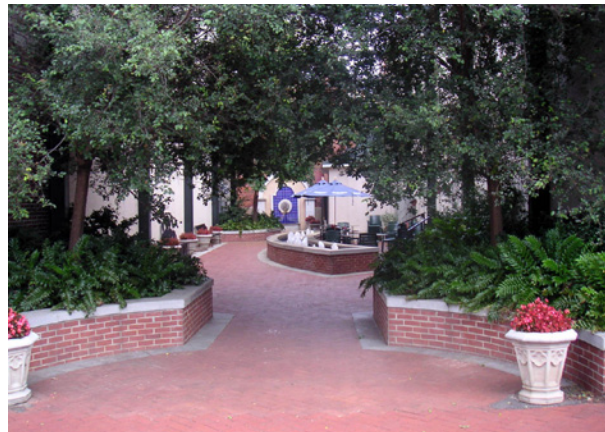
Expand active and passive parks and link them with clearly marked pedestrian trails.