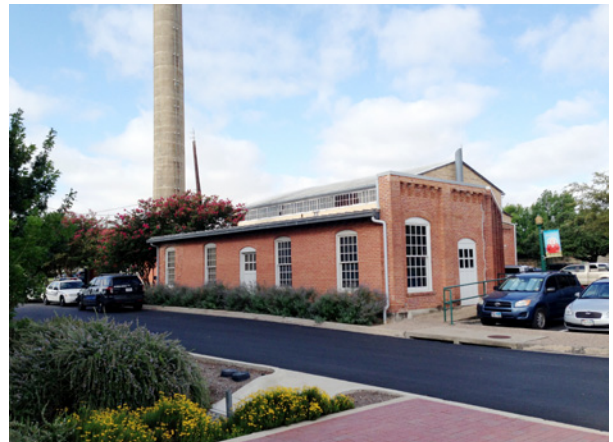
The old police station is envisioned as becoming part of a new municipal center centered around 8th Street, which will be a flexible-use festival street for special events.

This site is also proposed as a major activity center in the Framework Strategy. It lies between Rock Street and Martin Luther King, and is centered along 8th Street. The existing civic icon is the central library. In the long term, this area should develop as a campus for city offices. The street would be designed as a flexible space, to be closed for festivals and markets, to complement activities around the courthouse square. A few build-out scenarios are proposed in Chapter 8.