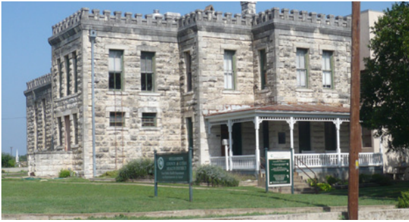
The historic jail is envisioned as redeveloping into a bed and breakfast, art gallery, museum or similar use to benefit the public and activate this area of downtown.