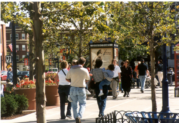
Enhance pedestrian systems and connections.