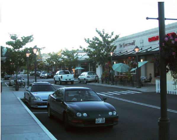
Buildings and streetscapes should help frame the street and make it inviting to pedestrians.