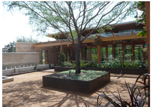
El Monumento terrace helps establish an activity center focused on the river.

This city icon already acts as an activity center in its own right. Improved trail connections to the river trails and pedestrian connections along Austin Avenue will further activate this area. New modest liner buildings could be built along Austin Avenue on this property to help frame and activate the street.